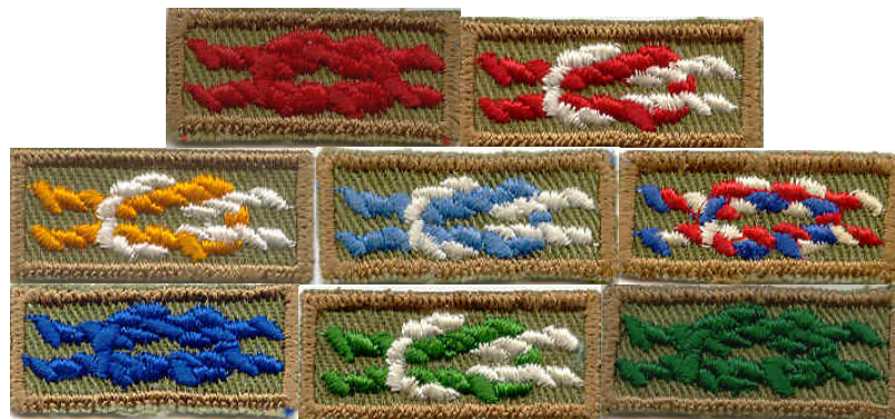
Honor Medal, Silver Buffalo

In 1946, square knots were introduced and ribbons phased out. All the awards above had square knots, illustrated in order below. The March 1946 announcement left out the Honor Medal, Eagle and Quartermaster knots because they had other embroidered badges, but they were available shortly. The January 1, 1947 price list still had the Eagle ribbon bar, but the October 1947 catalog had the square knot. 4