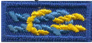
Den Leader Coach Training Award