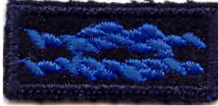
Quartermaster (blue on blue)