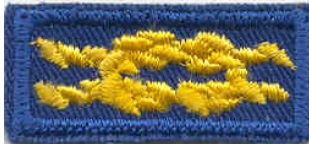
Den Leader Training Award