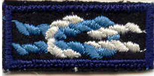
Silver Beaver (on blue)