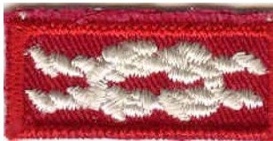
OA Distinguished Service