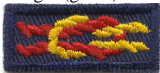
Silver Award I