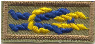
Medal of Merit