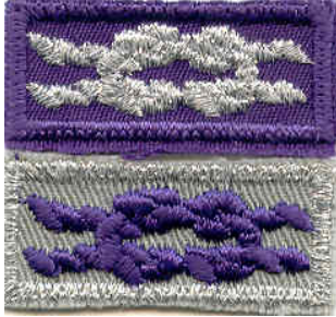
Youth and Adult Religious Awards