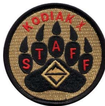
Kodiak X Staff

All Nature of Leadership badges are intended for Venturers only. Adults, who have taken the Kodiak/Kodiak-X Course Directors Course and are promoting Kodiak or Kodiak X course, may temporarily wear the medal.