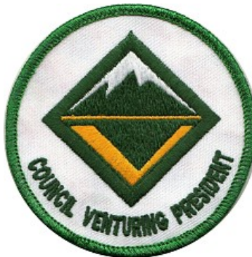
Council President (2007)