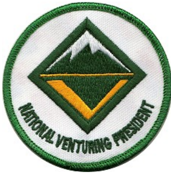
National President (2000)

As a carry over from Exploring, Venturing also had National officers. These were the National and Regional Venturing Presidents. Beginning in 2001, the National Sea Scout Boatswain became a member of the National Venturing Cabinet so that position badge is included here for completeness.