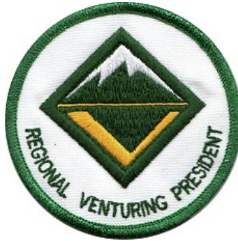
Regional President (2002)