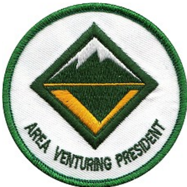
Area President (2007)

Additional Venturing President position badges were added in 2007. These positions are not part of the National Venturing Youth Cabinet.