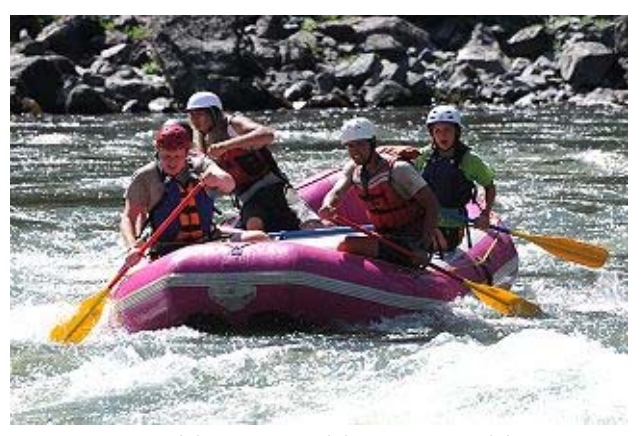
Sunshine as a whitewater guide

Retaining a boy in a troop until he is 18 certainly serves to provide a good role model and leader for the younger boys, but I suggest it does not help to fully develop a young man. Learning to lead your peers has great value.