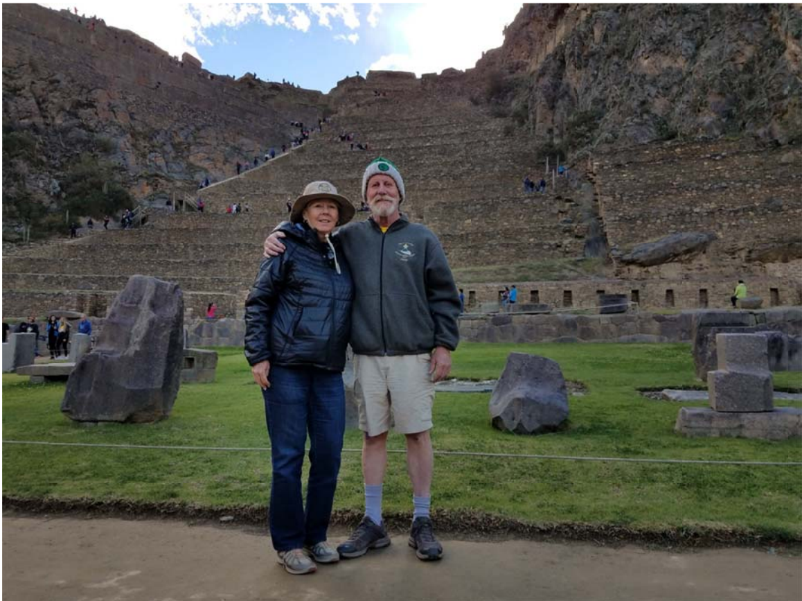
Ollantaytambo with my wife