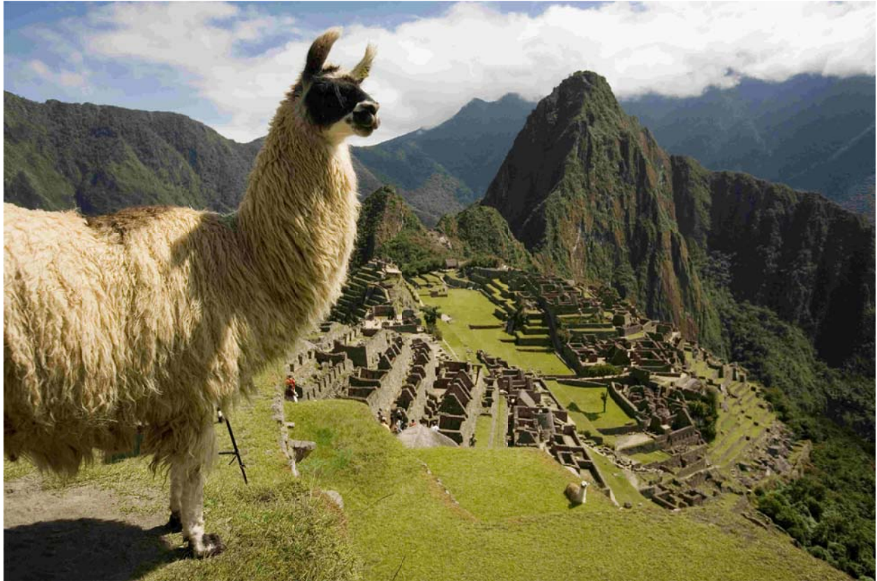
Machu Picchu with the “lawn mower” llama

The last place we visited was Cusco, where we would catch our flight home. Cusco was interesting as it was the location the religious and administrative capital of the Inca Empire which flourished in ancient Peru between c. 1400 and 1534 CE. In Cusco, we saw the 12-sided stone which is emblematic of Cusco and the logo of the Peru Moot.