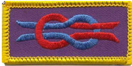
University of Scouting,