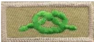
Second Miler Award

The Utah National Parks Council has had this knot since 2006 or before. It is also used in the Great Salt Lake Council. It is awarded to Scouters with two-five years service who have “gone the extra mile” in supporting district or unit level programs. It is awarded by the district to those who have not earned the District Award of Merit, and may be earned more than once.