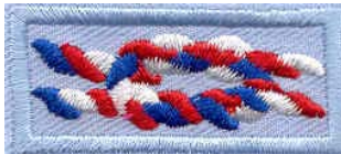
Eagle - ANG

Beginning with Paul Siple in 1929, Scouts (usually young men 18-22) have been going to Antarctica with the United States expeditions there. There is a square knot for those invited to participate. Michaud states it was awarded by the National Science Foundation, circa 1960s. Gary Whitman, another collector, had been told verbally by a person at National that the knot was authorized by the BSA, but we have been unable to find a document saying so. Only a few (less than 10, only six by 1990) Scouts/Scouters have qualified in the Scout role. The military awards a campaign medal and ribbon for Antarctic Service to people who meet certain criteria. Many more have probably earned the military decoration. In 2010, I was advised by Parker Smith, a Jamboree Sea Scout I served with, that the South Florida Squadron uses this knot for their "Shackleton Award" for leadership named after the famed Antarctic explorer, Capt. Ernest Shackleton.