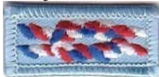
Eagle - CAP