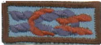
Pocono District Service Award