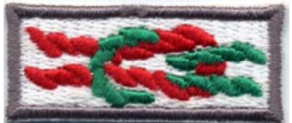
Youth Leadership In America