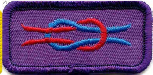
University of Scouting Staff