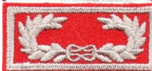
College of Comm Science

The Great Salt Lake Council had a knot-sized award, red with a white or grey/silver commissioner’s wreath, which was awarded to those who attended their College of Commissioner Science . They also had a Master’s pin in gold color and a Doctor’s pin in silver color to indicated earning those degrees. The gold pin is a copy of the commissioner pin for the Scouter’s Key. The silver pin is the same, except for the color. Neither are BSA manufacture that we are aware of. The examples are made in Taiwan. Thanks to Craig Murray, who brought it to my attention. GSLC no longer does this due to the official Doctoral knot.