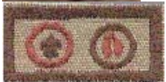
District Scouter of the Year