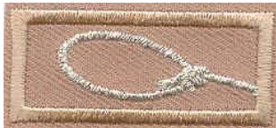
College of Comm Science

The Utah National Parks Council has had this knot since 2006 or before. It is also used in the Great Salt Lake Council. It is awarded to Scouters with two-five years service who have “gone the extra mile” in supporting district or unit level programs. It is awarded by the district to those who have not earned the District Award of Merit, and may be earned more than once.