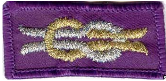
Dean Univ Scouting