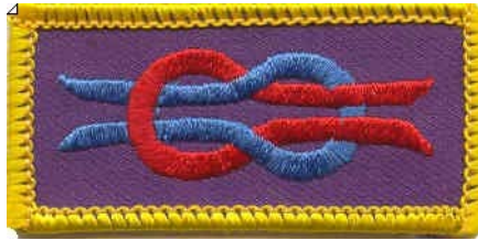
University of Scouting,