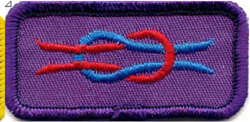
University of Scouting Staff