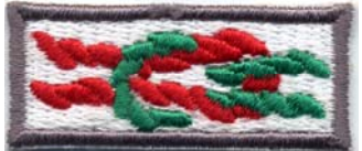
Youth Leadership In America