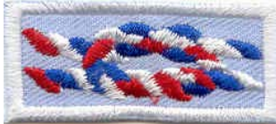
Eagle - USCG

In the 1960s, the Eagle Scout knot was adapted slightly by the Air National Guard (ANG) and by the US Coast Guard (USCG) . It was issued to Eagle Scout adults who were leaders in Air Explorers and Sea Explorers. The Air Explorer knot had a blue border, the Sea Explorer knot had a white border. The Sea Explorer knot did not have the same pattern of red/white/blue rope twists as the standard Eagle knot. These knots were never adopted by BSA. Another variety has a rolled edge, and was remembered by Frank LaGrange as from the CAP from 1962-3 when he was an Air Explorer.