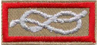
BDAC Big Horn

The red bordered Eagle knot on the left is a local council authorized Distinguished Eagle knot, even though the BSA uses the gold eagle on the regular Eagle knot to identify a Distinguished Eagle.