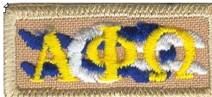
Alpha Phi Omega