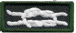
Advisor Award of Merit