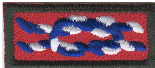
ISPI Scouter Service