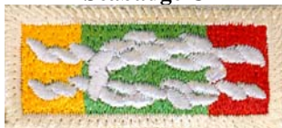
Boyce New-Unit Org