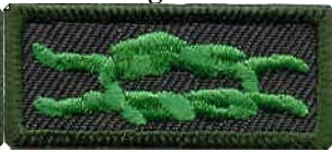
Scouter's Training Award