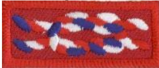
Eagle Scout (red jacket)