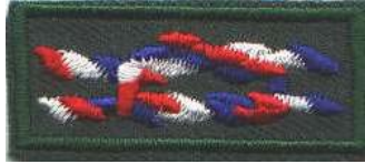
Original Eagle Knot