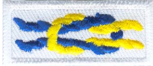
Medal of Merit