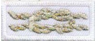
Youth Religious Award