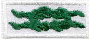
Scouter's Training Award