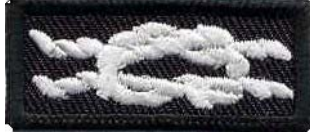
VAAM or QM