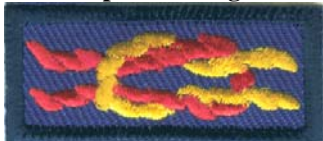
Explorer Silver Award