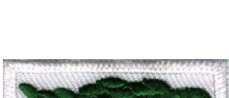
Scouter's Training Award