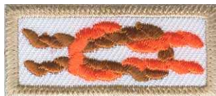
Varsity Denali Award