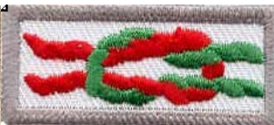
Youth Leadership in America