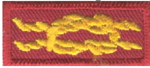
OA Founder's Award