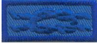
Den Leader Coach