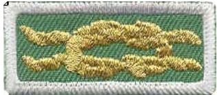
Girl Scout Gold Award