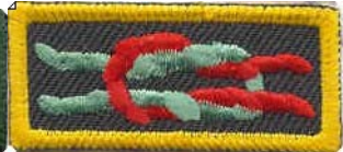
Arrow of Light